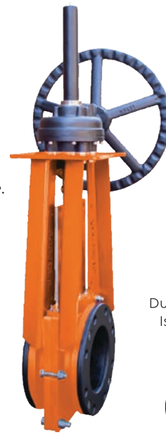
Dual Sleeve Isolation